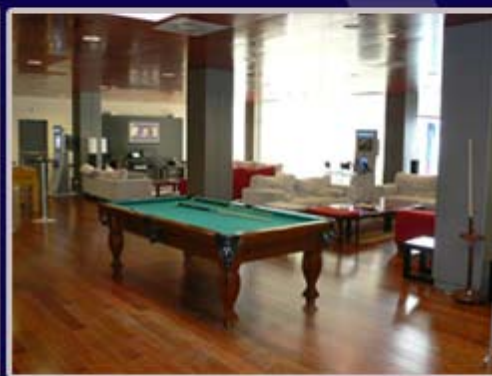
Hotel Lobby, TV, and game room area.