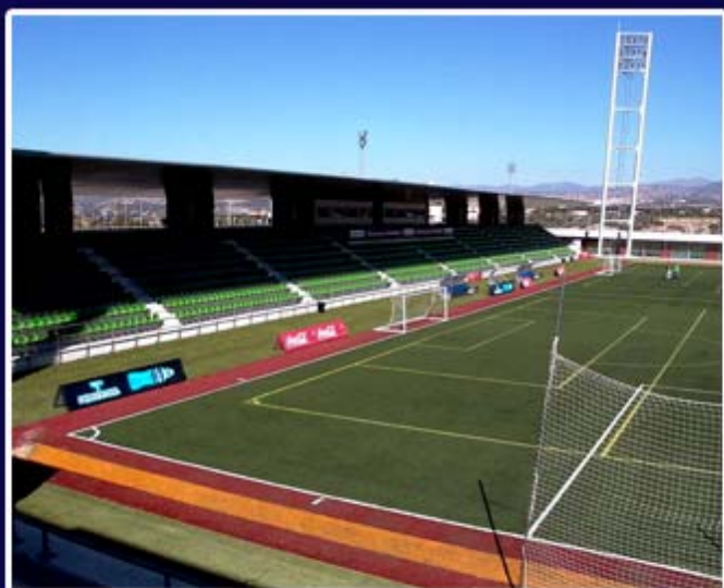
Latest generation artificial grass field.

eSoccer brings you the opportunity to have an exclusive experience at the Spanish Soccer Federation Complex, "City of Futbol," home of Spain's National Futbol team. With his 3 full side natural grass fields, one latest generation artificial grass, and a goalkeeping training field this complex has everything that a futbol team needs to take their game to the top level. All fields have their own lighting, 2 of them with stands that hold over 1000 people and with locker rooms connecting to all the fields. The complex also has an indoor futsal arena (Spain is currently Futsal World Cup champion). A Gymnasium, assembly hall, classrooms, meeting rooms can be used for coaches' seminars, clinics, team meetings, videos etc.