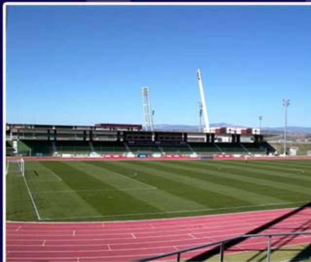
Spain's National team training field.